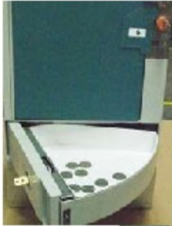
Cash Collection Tray