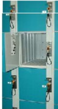
Ribbed, Angled Shelves